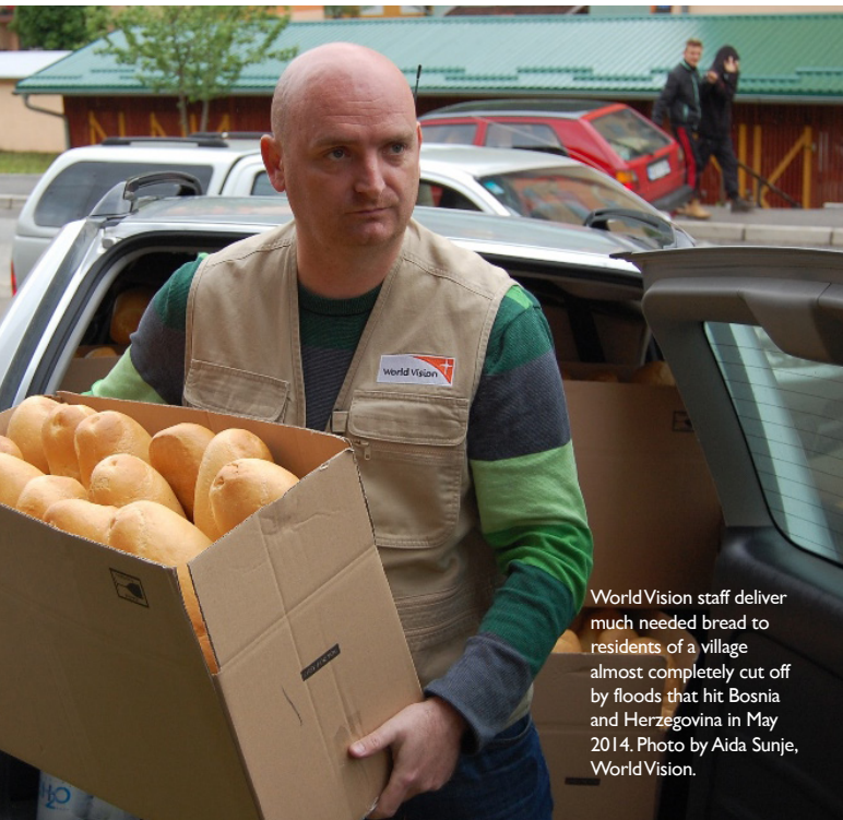
World Vision staff deliver much needed bread to residents of a village almost completely cut off by floods that hit Bosnia and Herzegovina in May 2014.

Life can be especially hard for children with disabilities in Bosnia and Herzegovina. World Vision tries to level the playing field by providing additional support and training to those who have physical or mental disabilities as well as their parents or caregivers, helping them to grow up strong and someday be able to integrate into society.