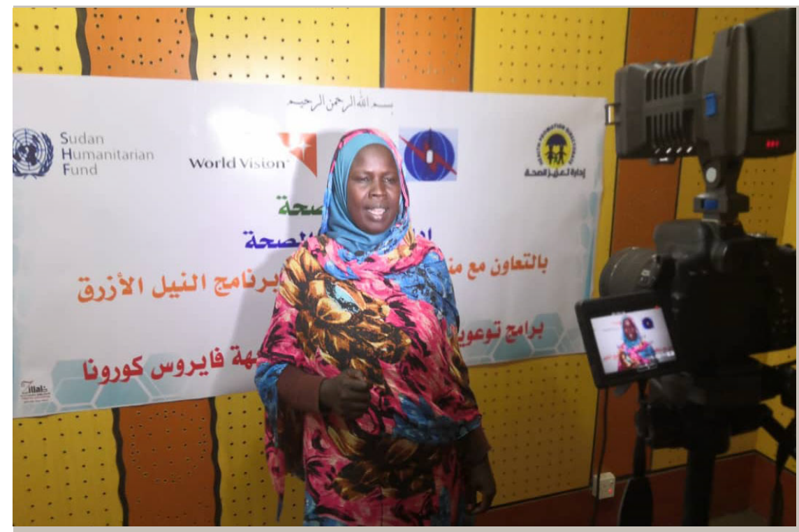
World Vision is engaging with community leaders and the Ministry of Health to spread and reinforce COVID-19 preventive measures through mass media.