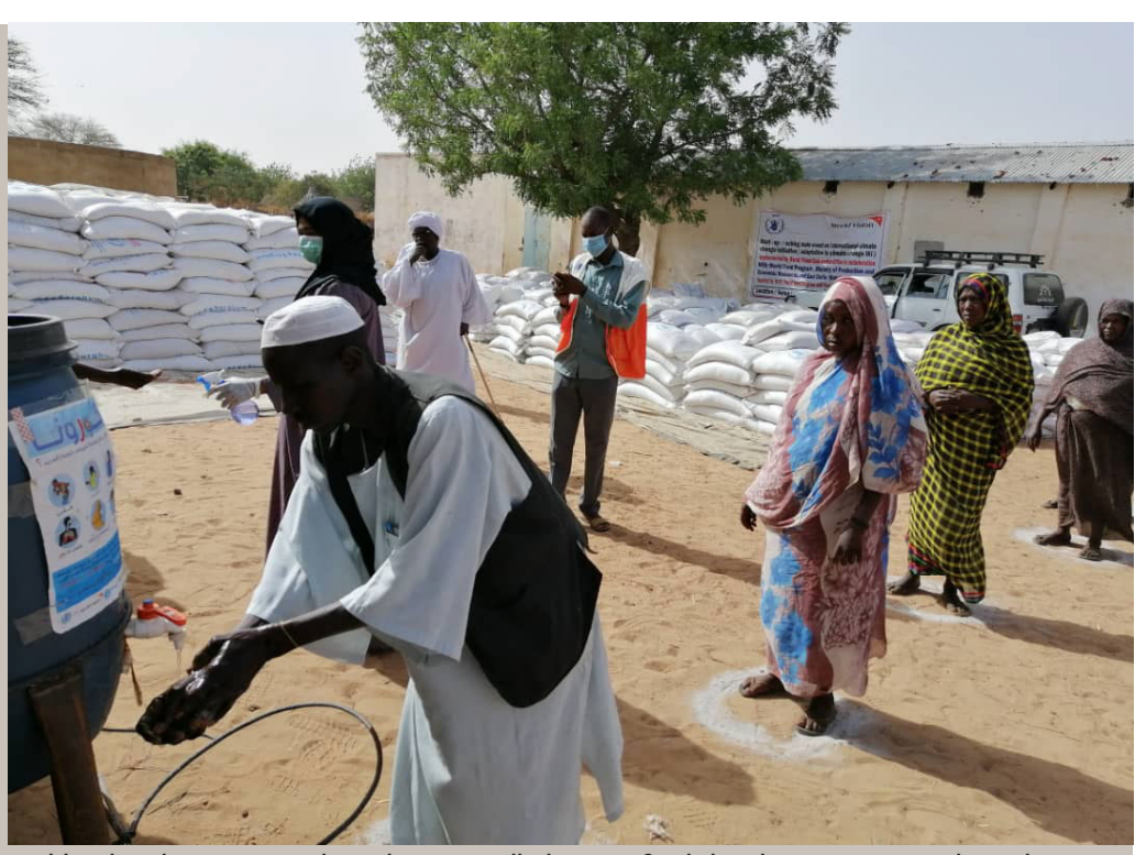
Handwashing stations have been installed in our food distributions sites such as this one in East Darfur state where beneficiaries wash their hands before receiving food.