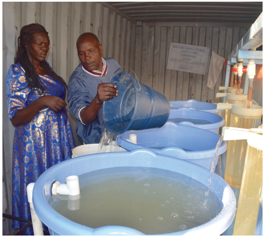
The eggs retrieved from the mouth of the fsh are made to hatch fast at the KIBA hatchery in Homa Bay County, Kenya.

At Homa Bay County in Kenya, many households have adopted aquaculture, thanks to enhanced awareness and training by World Vision in partnership with the government.