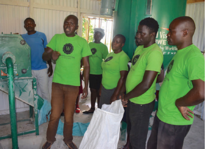
Members of the Waringa Youth making fsh feeds at a processing plant that was established through the support of World Vision and BMZ at Lambwe Valley in Homa Bay County.