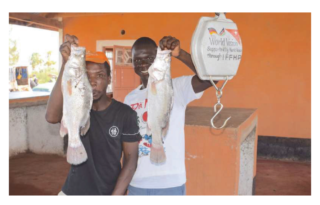
Fishermen at one of the fish holding units (Bandas) established through the support of World Vision & BMZ at Doho Beach in Kenya's Homa Bay County.