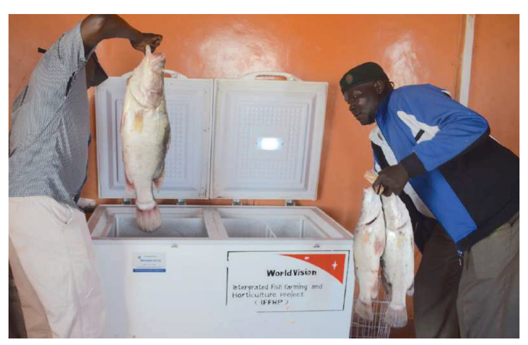
Fishermen storing fish in a cooler (deep freezer) at a fish holding unit (banda) established through the support of World Vision & BMZ at Doho Beach in Kenya's Homa Bay County.

"We employ people to weigh the fish, keep records, clean the banda and store fish in the right place. This gives them additional income that enables them to take good care of their children and families."