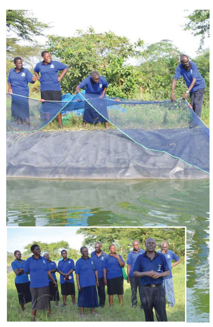
Members of the Jowiro self-help group that have made bumper harvests through the use of pond liners in Homa Bay County, Kenya.

In a bid to tackle the problem, World Vision – through funding from BMZ- has empowered farmers to acquire pond liners that help in water retention. As such, farmers are able to have sufficient water that sustains fish during their growth cycle in the pond.