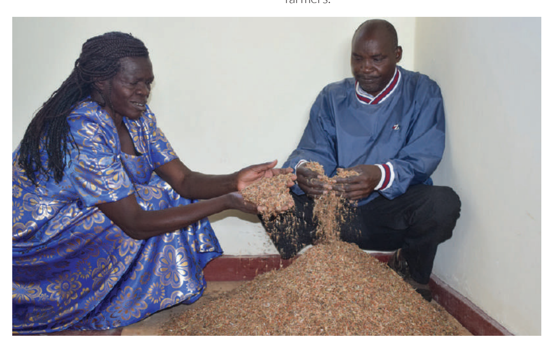
Members of the KIBA Self Health group displaying shrimps that are used to prepare fish feeds, Homa Bay County.

This has brought down the cost of feeds, making them affordable and accessible to communities. In Homa Bay, the basic ingredients for making feeds such as rice, wheat bran and the fishmeal - like shrimps and fingerlings (omena) - found along the lake are readily available. This is of great benefit to fish farmers.