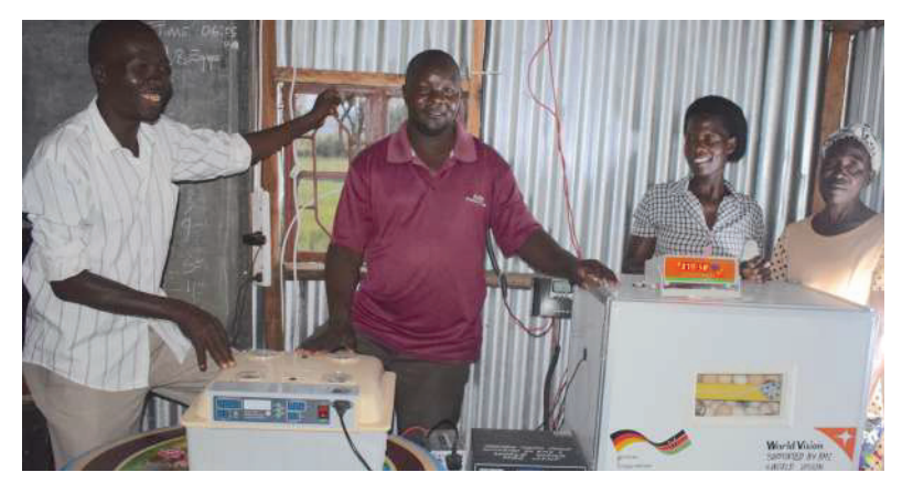
Members of the Ogando self-help group using the solar poultry hatchery that they received through support of BMZ and World Vision.