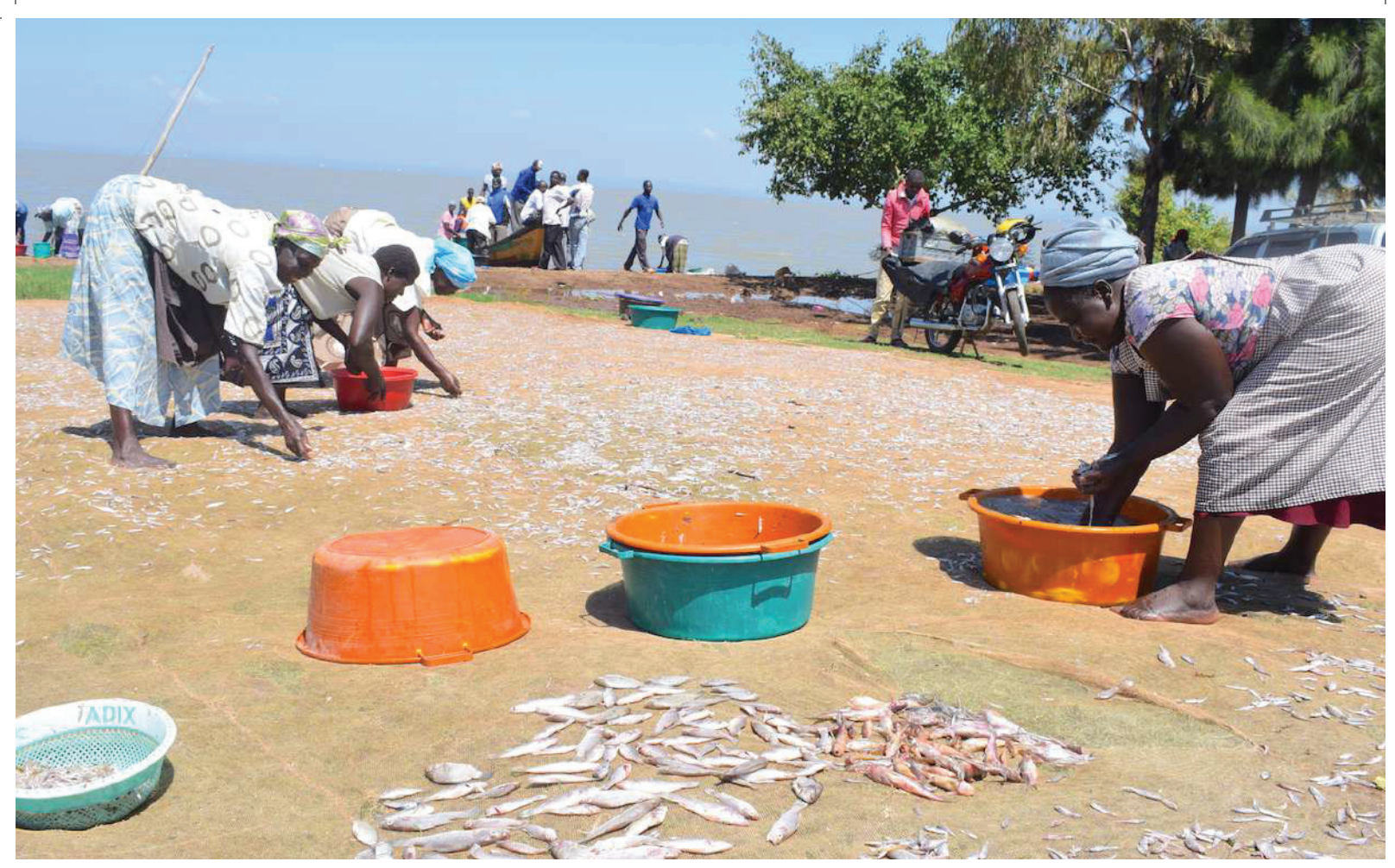
Women drying fsh and fngerlings (omena) along the shores of Lake Victoria.