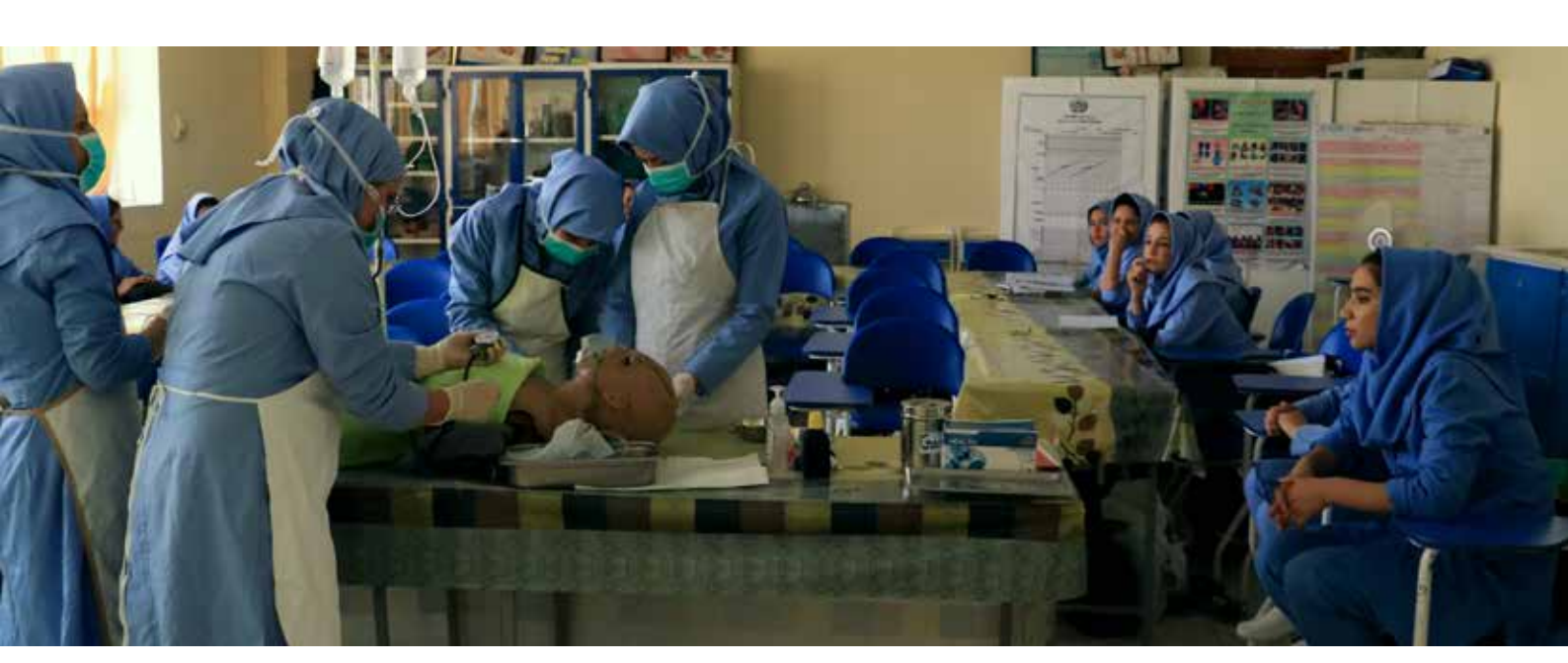
Female students studying midwifery at the Herat Institute of Health Sciences, supported as part of World Vision's MNCH programming.

World Vision's health programming in Afghanistan has naturally flexed between 'humanitarian' and development' approaches, driven by advocacy to highlight health system gaps and needs, identify resources from humanitarian or development donors, and merge these resources into a coherent nexus approach. In practice, this has meant the short-term and medium-term deployment of mobile health teams to drought-affected displaced populations, and now to communities affected by COVID-19. Mobile health teams target communities that continue to be affected by displacement, but also reach communities in 'white areas' at risk of COVID-19 that lack basic health services. Mobile health teams complement World Vision's long-term commitment to strengthening health systems and extending MNCH services in hard-to-reach, rural and remote areas affected by chronic underdevelopment – a 'joining up' of humanitarian and development approaches. Two of the most important initiatives exemplifying a nexus approach have been the midwifery training programme