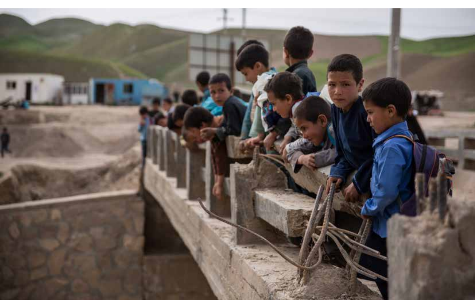
After school, children outside of Qala-e-Naw, Badghis province, stand on a bridge to watch peolpe below washing clothes and carpets.

humanitarian funding. This can create a lengthy process to advocate with bilateral humanitarian donors for the acceptance of interventions that practically meet needs but may colour outside of the cluster-prioritised lines.