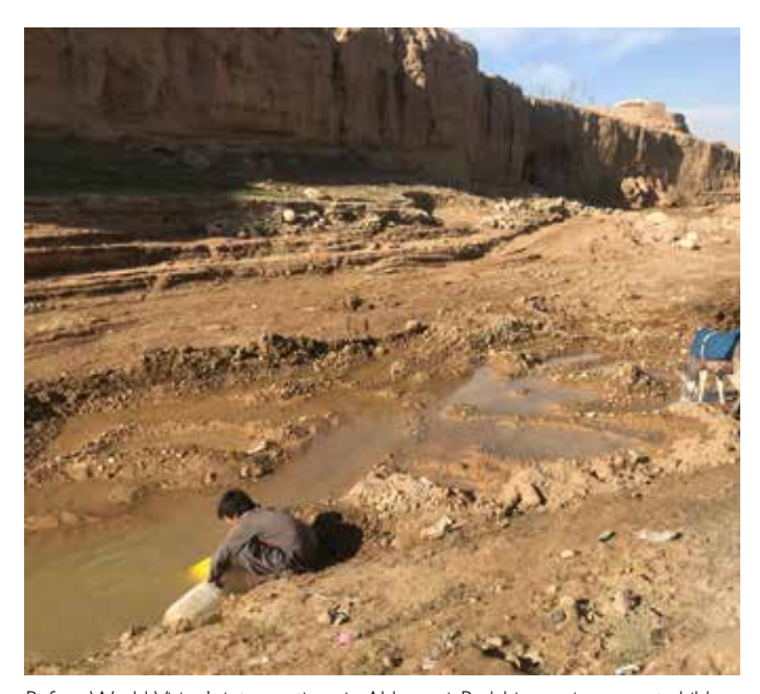
Before World Vision's interventions in Abkamari, Badghis province, most children only had access to poor quality surface or groundwater.

Though the 2018 drought brought western Afghanistan's population to the brink of life and death, the challenge to access clean drinking water in Badghis province has been chronic. The most available source is groundwater, but the salinity has been too great to consume safely. Among displaced people, 58 per cent do not have access to water and 65 per cent of returnees from Iran, now in and around Herat, do not have access to water and sanitation services. COVID-19 has increased the number of people in need of clean water, sanitation and hygiene items by 2.3 million people as of June 2020, in particular to help improve access to hand washing and hygiene.<sup>29</sup>