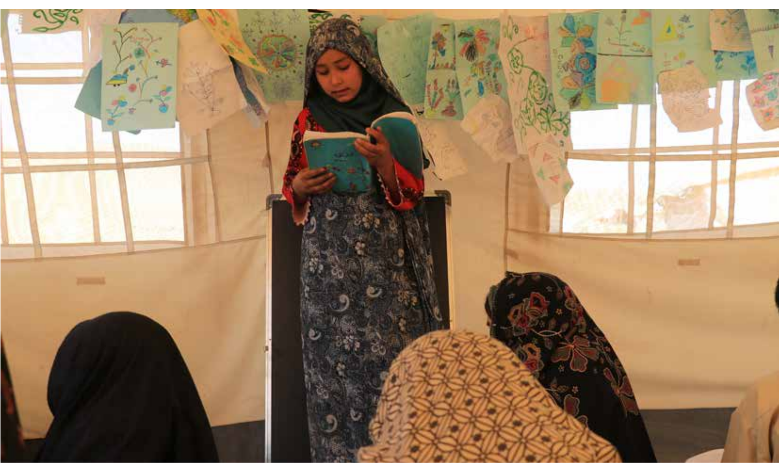
Education in a Temporary Learning Space for children displaced by the 2018 drought emergency. Priority is placed on ensuring opportunities for girls' education to help address gender inequality.

June 2020. In addition, 35 million people are in need of a social safety net – demonstrating the need for humanitarian and development solutions to work across the nexus to address the sweeping impacts of COVID-19.16