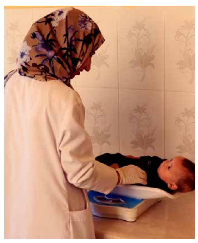
A midwife treats an infant in a Family Health House, bringing health services closer to home in Herat province.