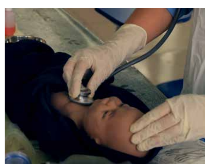
A student practices during her midwifery courses at the Herat Institute of Health Sciences

Family Health Houses (FHHs) represent another initiative across the humanitarian-development nexus. These structures ensure reproductive MNCH services are available in rural areas. Though the Health Post is intended within the BPHS to be the structure closest to community level, Health Posts are staffed by unpaid volunteers and are capable only of providing family planning or routine essential medicines such as