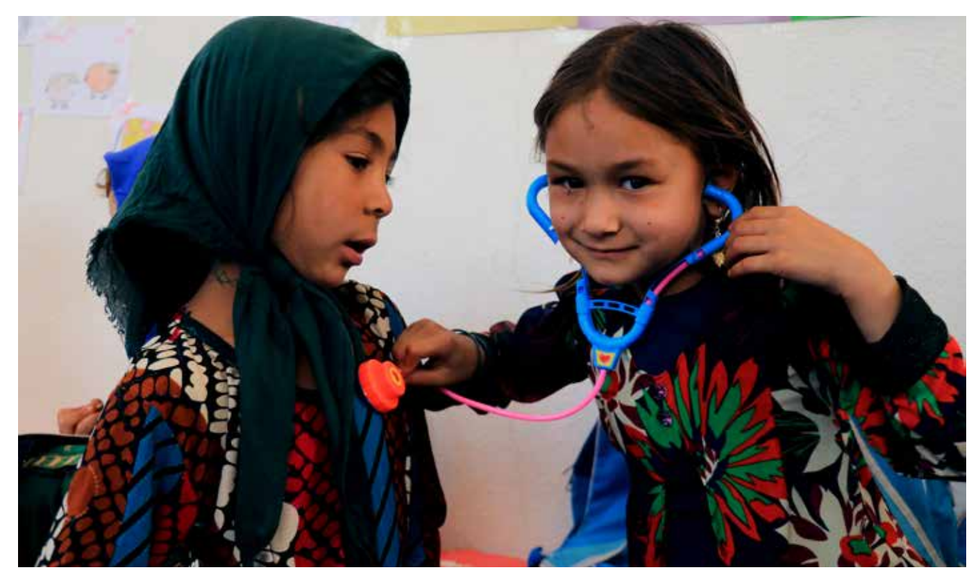
Girls playing together and learning about health in World Vision's education programmes.

The reach of the global pandemic has not spared Afghanistan. According to the Ministry of Public Health (MoPH), by October 2020 over 40,000 people in all 34 provinces have been confirmed to have COVID-19. Due to limited public health resources and testing capacity, as well as the absence of a national death register, confirmed cases of and deaths from COVID-19 are likely to be underreported overall. The pandemic has pushed more people to the brink, increasing the number of people in need of life-saving humanitarian assistance from 9.4 million in December 2019 to 14 million by