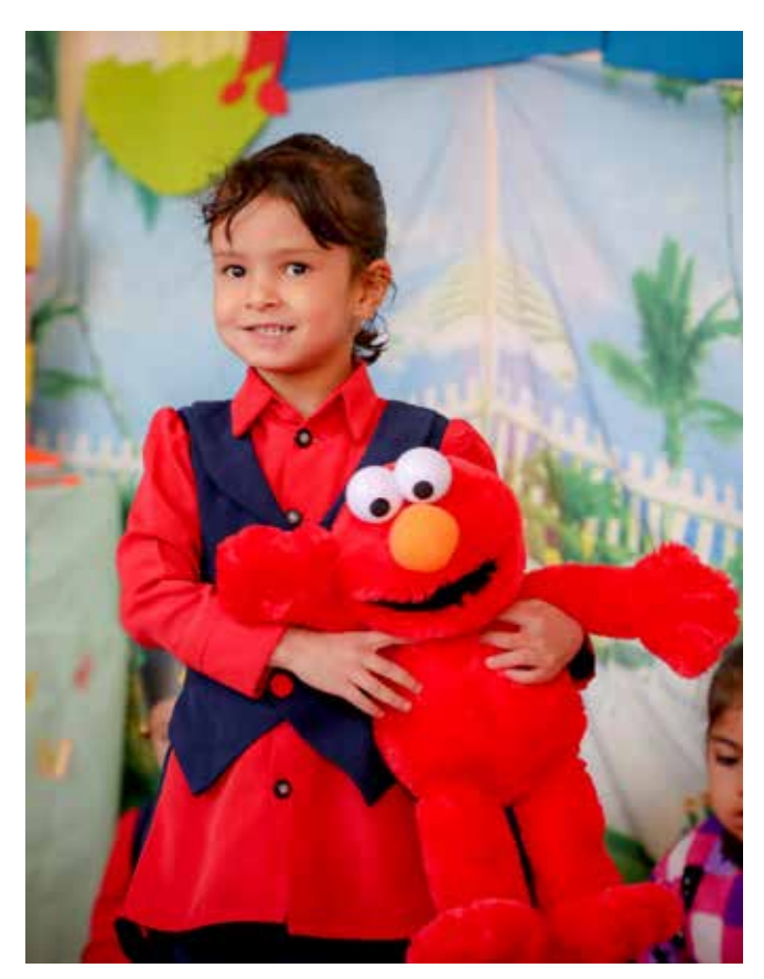
A six year-old girl learns and plays at an ECD centre in Badghis.

ECD has not been well incorporated into EIE in IDP settlements either. This has been due to a lack of resources, a prioritisation of short-term interventions, and a reported perception that ECD is 'development' or a 'luxury' and therefore not life-saving for displaced children. Absence of durable solutions for IDP children effectively result in their learning experience within a TLS functioning as regular primary education, and thus the benefits of ECD as an early entry point to education, particularly for girls, is just as essential.