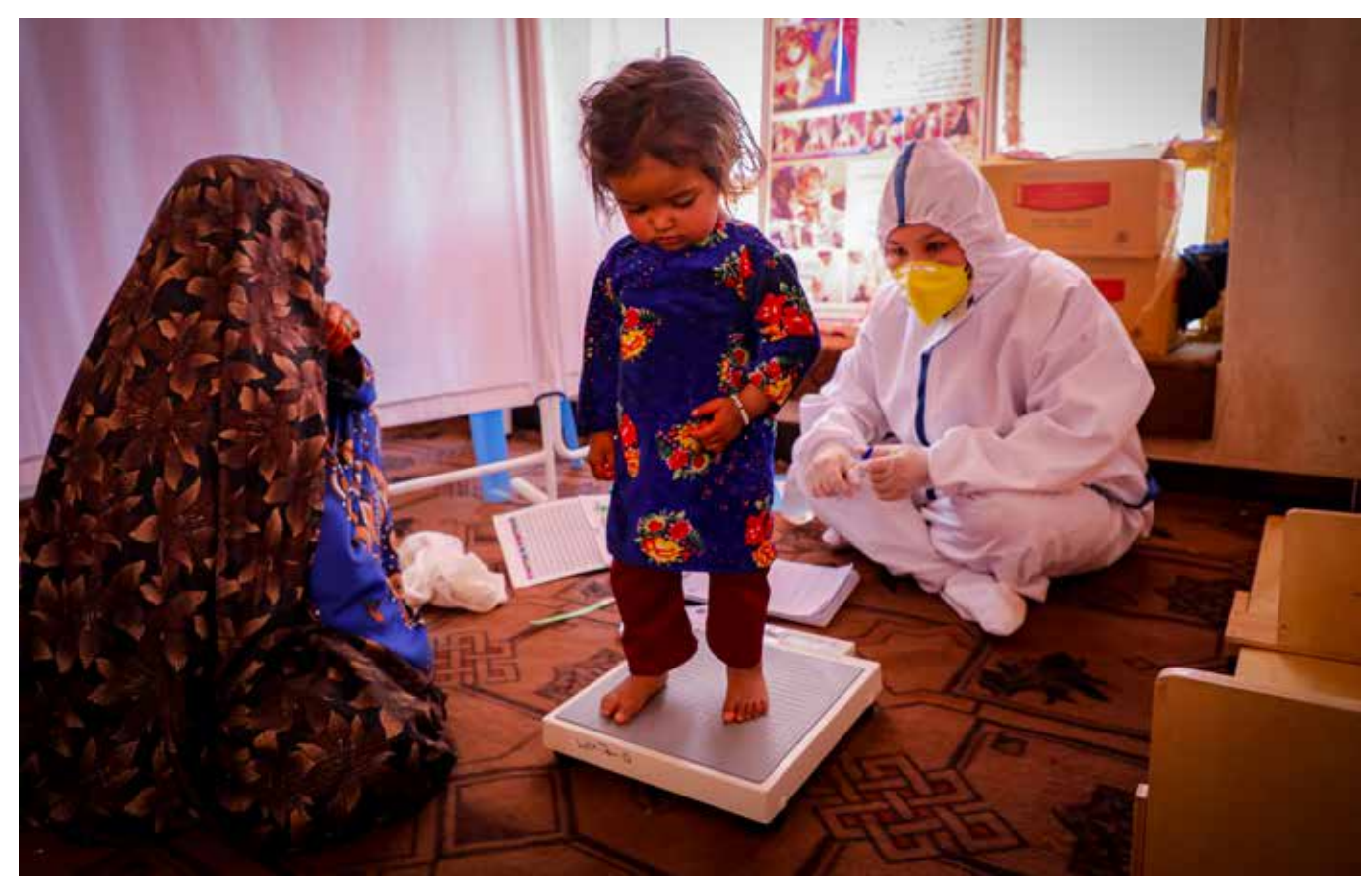
A nutrition nurse from World Vision's mobile health team continues nutrition screenings during COVID-19 response.

• Long-term community presence and partnerships. One of the most common challenges cited by many single-mandate humanitarian actors is lack of access. As a multi-mandate organisation with 98 per cent national staff, the majority local, World Vision's commitment to stay, deliver and address community needs year on year, often requiring a delicate balance of mixing humanitarian and development donor funds and internal resources, has helped build significant trust. Partnerships with Imams, faith groups, elders, chiefs and community