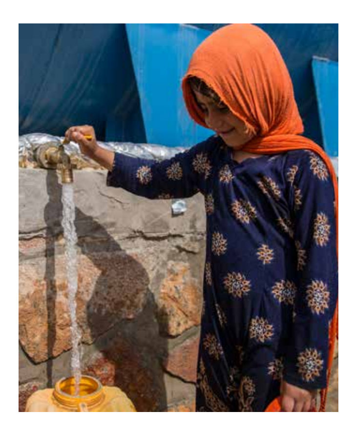
A girl in Chahkaran, Badghis province collects clean drinking water from the village's new water treatment system which uses reverse osmosis.

water-trucking services immediately, while continuing to scale the RO units in the IDPs' rural places of origin, working with community members who stayed behind. Extensive advocacy was conducted with the WASH Cluster and donor community, and a full business case was developed to highlight the efficiency and sustainability of the RO units from a cost-benefit perspective. In one of the villages the RO unit worked so efficiently that a peer international NGO used its emergency grant funds from a humanitarian donor to purchase water from the community's pumps for water trucking to the IDP settlements in Qala-E-Naw.