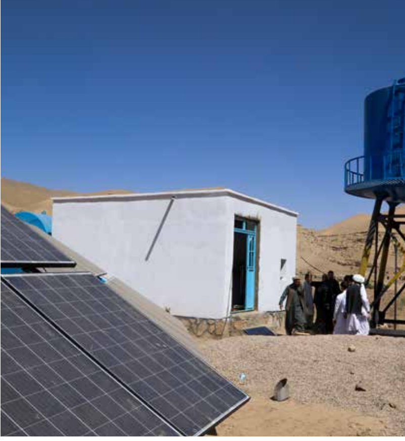
An innovative approach - an RO operator, unit and water treatment system - treating highly saline water to become a safe drinking source, powered by solar energy for sustainability.

"We value the RO unit. Before, there were so many illnesses from drinking bad water or boys who were lost while walking long distances to collect water. The route is not secure. Now, we have drinking water right here, and almost no illnesses anymore. We protect the RO with a guard and a fence we built. When there is fighting, we ask them not to attack the RO ahead of time. Our RO was still damaged once, but we worked together to quickly repair it. It has changed our village."