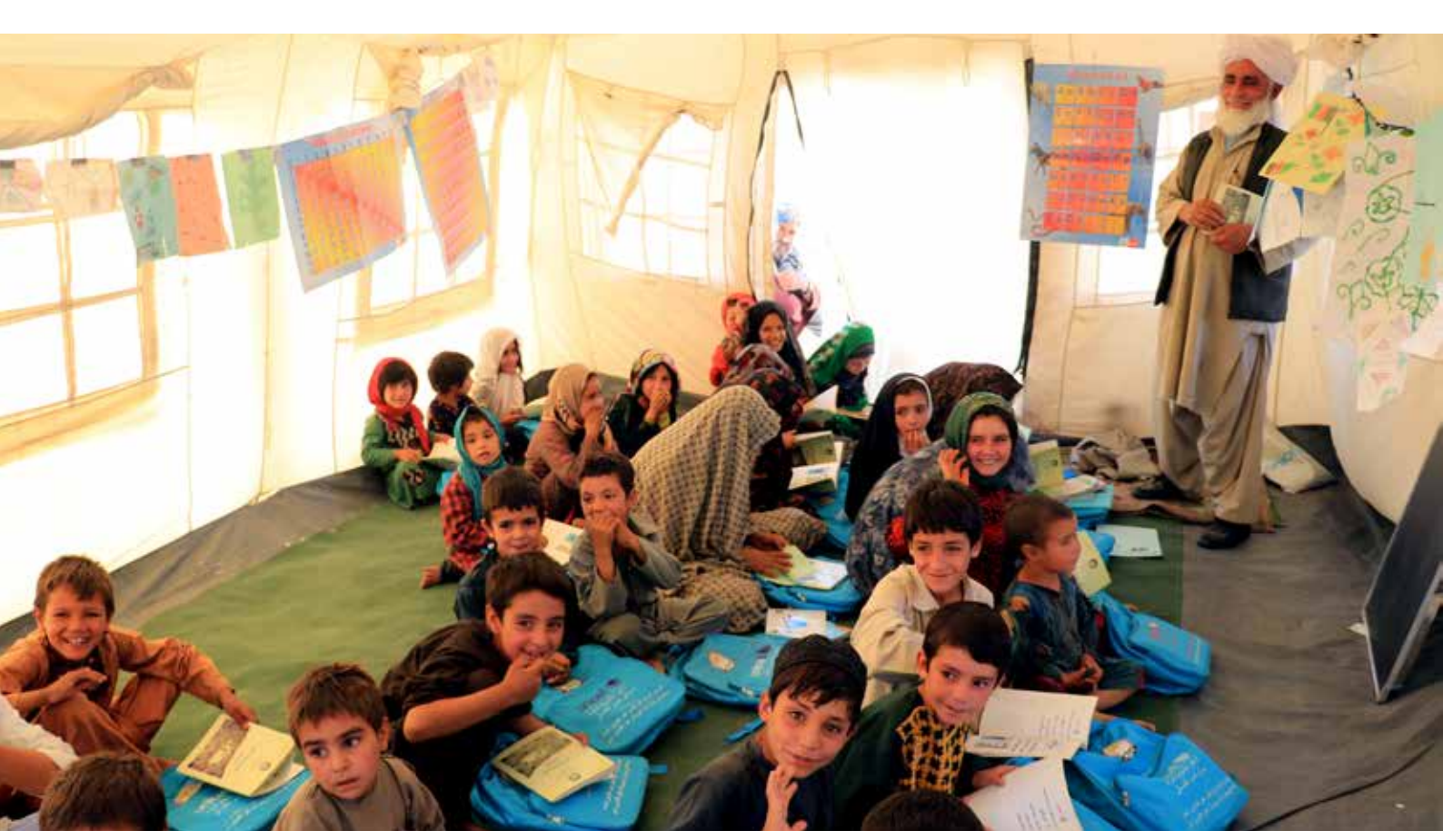
Girls and boys taking studies together from a TLS classroom in an IDP settlement in Badghis, through World Vision's EIE programming.

While it is essential for displaced children to receive education immediately as a means to prevent a gap in learning and cognitive development, as well as to provide a safe and protective space, the use of the TLS approach and the