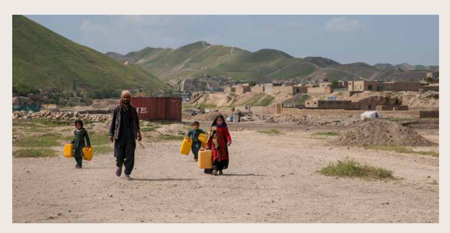
Safe drinking water collection possible now in Chahkaran, due to the introduction of reverse osmosis water treatment.

In many ways COVID-19 not only demands but increases the stakes for the necessity of a nexus approach. The same families in 'white areas' reached today in emergencies by mobile health teams need accessible primary healthcare tomorrow; families needing food and cash assistance today due to loss of employment need sustainable strategies to recover lost livelihoods. COVID-19 has demonstrated that a coherent approach, driven by evidence-based assessment of needs and gaps, has never been more critical. Many NGO actors such as World Vision have the experience and best practices to realise the nexus — what is needed now is for all stakeholders to continue to breakdown their silos and invest in these solutions.