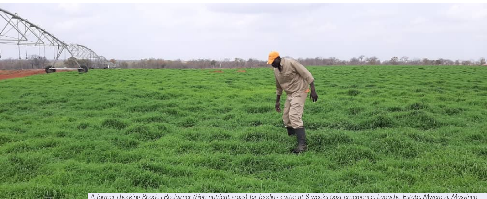
A farmer checking Rhodes Reclaimer (high nutrient grass) for feeding cattle at 8 weeks post emergence, Lapache Estate, Mwenezi, Masvingo

Other interventions seek to enhance the policy environment to reduce compliance costs , formulate a National Beef Strategy, establish the Zimbabwe Beef Producers Association and an online Livestock Information Management System . In addition, through the Nurture Finance model, beef producers will have access to genetically superior heifers and bulls through importation of live cattle.