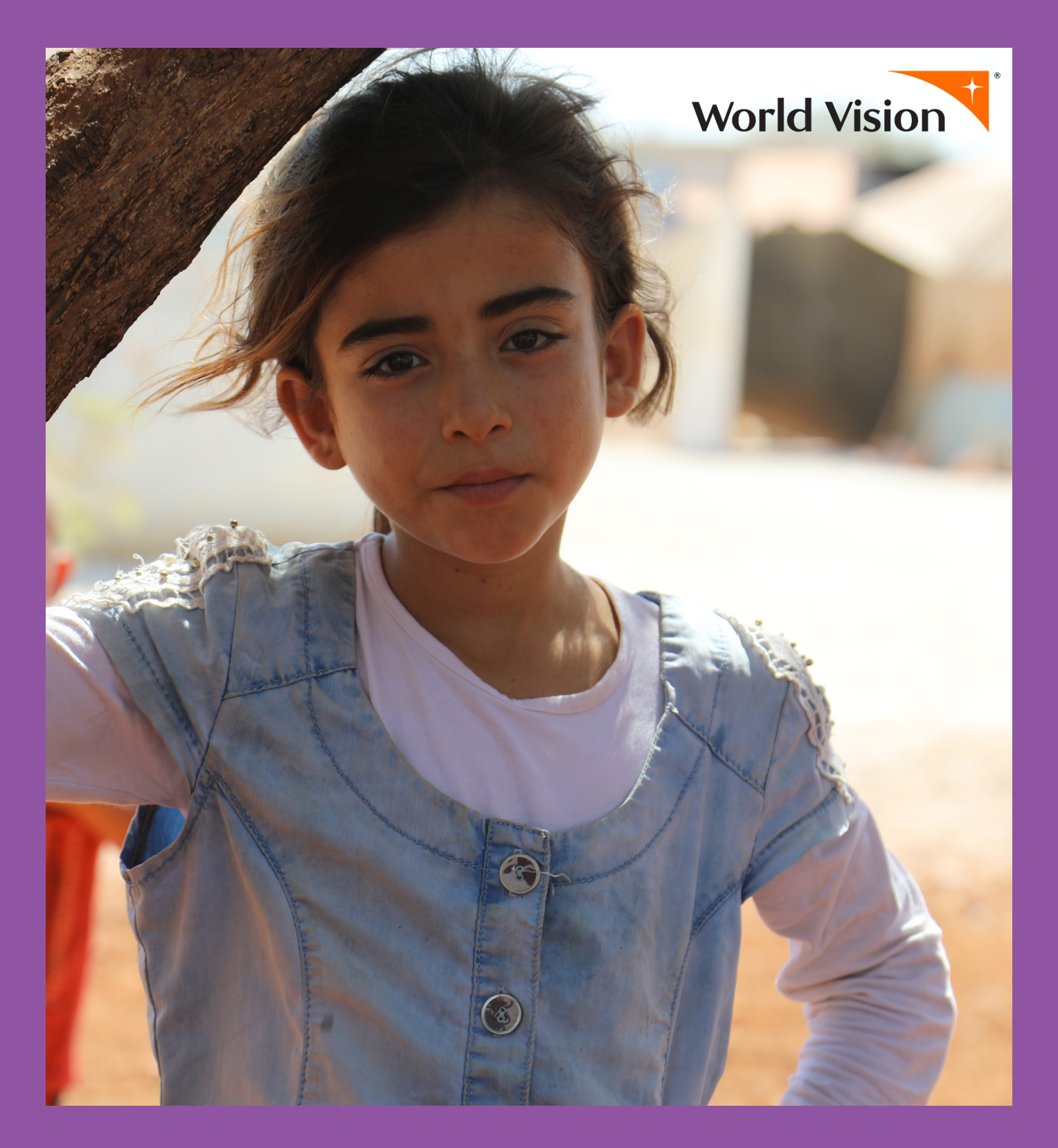
Child Protection and COVID-19