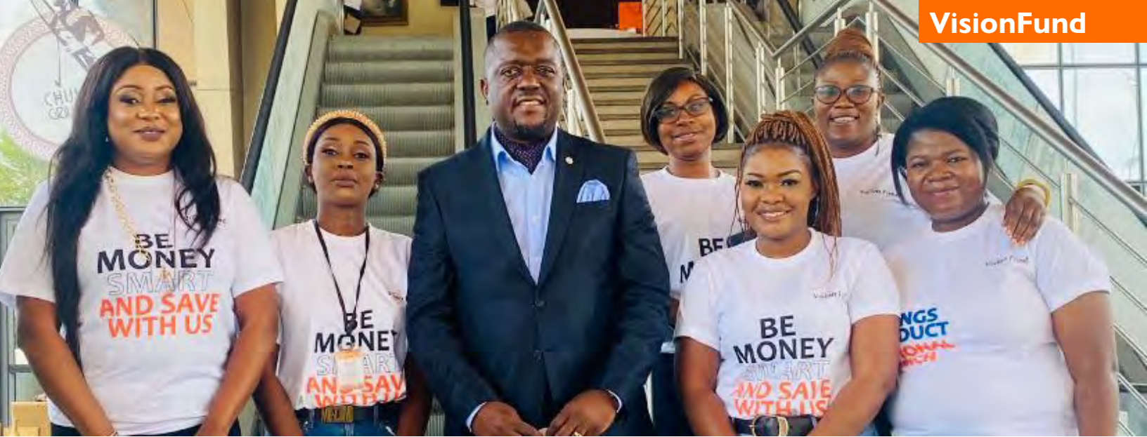
Minister of Local Government and Rural Development Hon. Garry Nkombo with VisionFund Zambia staff outside Radisson Blu.