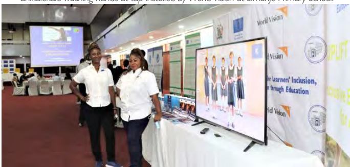
EU funded Urban and Rural Programme for Learners Inclusion, Foundation and Transformation (UPLIFT) staff at the EU exhibition.