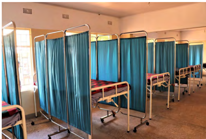
Inside the Maternity Annexe constructed by World Vision at Kanyongoloka