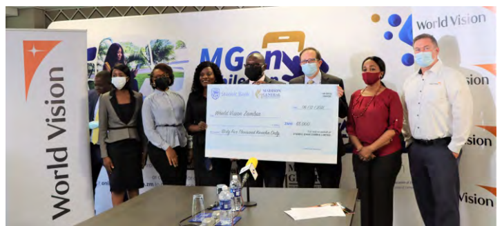
Madison General Insurance and World Vision Zambia representatives pose for a picture with a K65,000 donation dummy cheque by Madison.