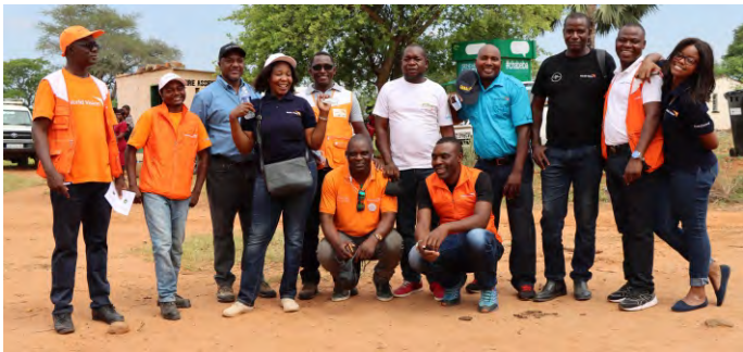
World Vision staff during the commissioning of the Solar Grid at Moyo Hospital.