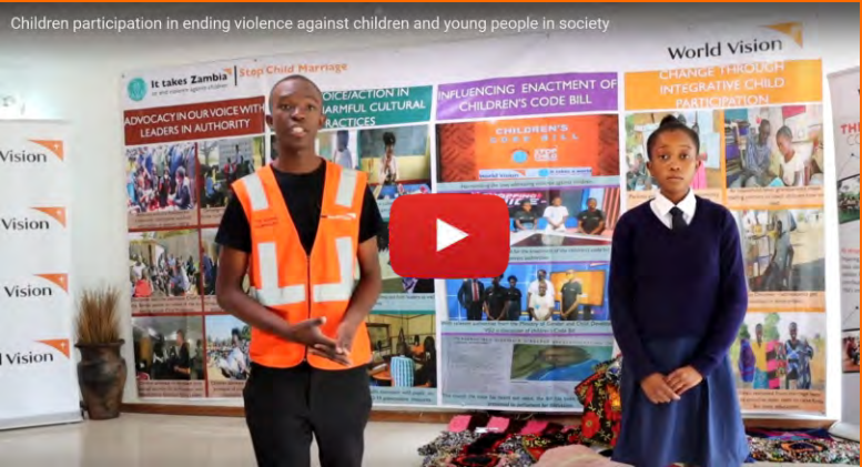
Children explain their interventions on ending child violence in schools and communities.