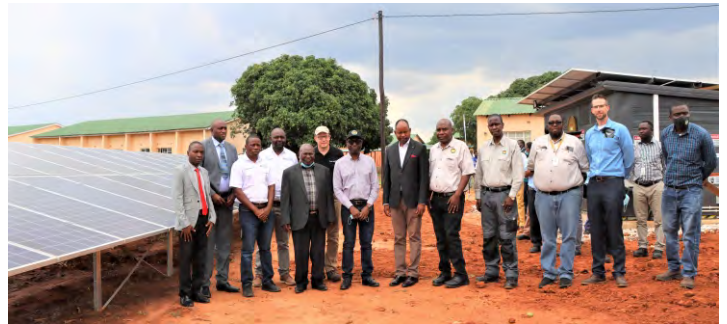
Government Delegates, and World Vision senior leaders next to the Solar Panels at Moyo Hospital.