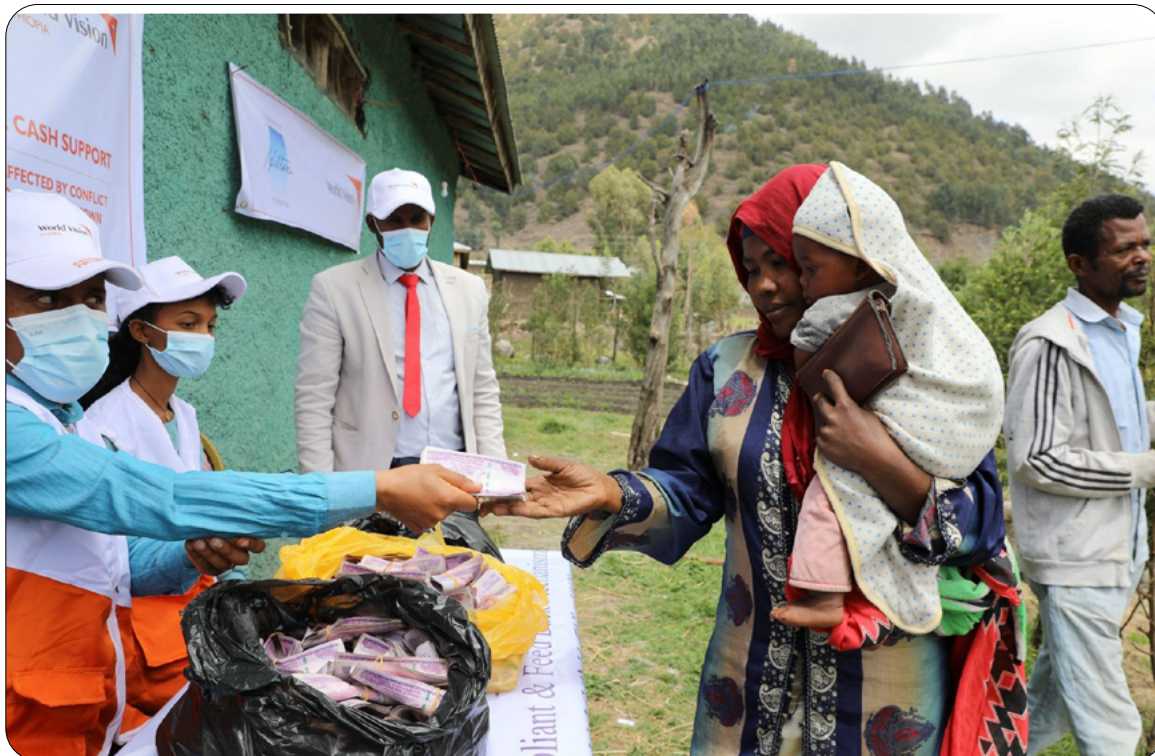
World Vision distributed multi-purpose cash assistance to 1,200 most conflict affected households in East Amhara Dessie – Kombolcha city of Amhara region.

We would like to thank our generous child sponsors, donors, partners, and supporters whose contributions make this work possible, including: