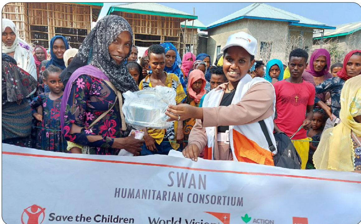
World Vision with the SWAN consortium provided non-food items to 1500 households (8740 people) IDPs from Kobo district in Merssa town, Amhara region.

We would like to thank our generous child sponsors, donors, partners, and supporters whose contributions make this work possible, including: