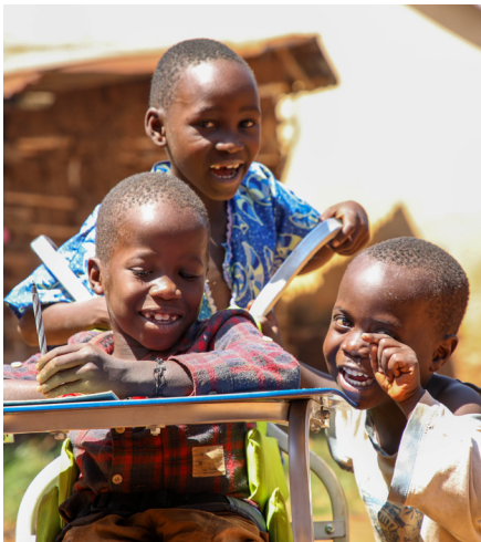
Learning for Life