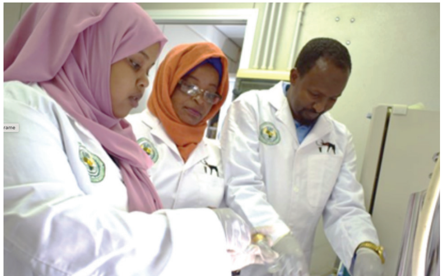
World Vision collaborated to research plant tissue technologies in the laboratories of the Technical Veterinary School and Reference Centre in Somaliland's Sheikh district

Our work also actively engages in the realignment of attitudes towards women and children's participation in the creation of a renewed and successful intergenerational relationship with the land and farming communities' future.