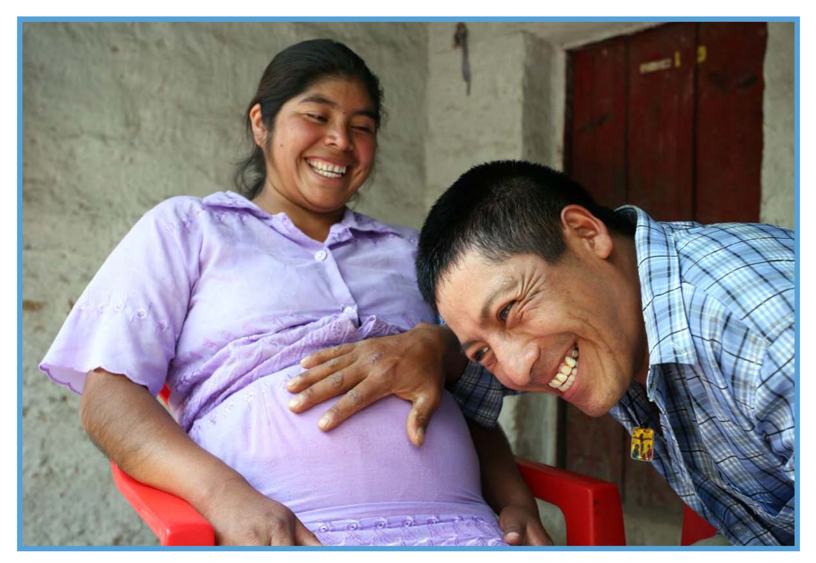
Emotional support for mothers is important for the overall well-being of mother and child.