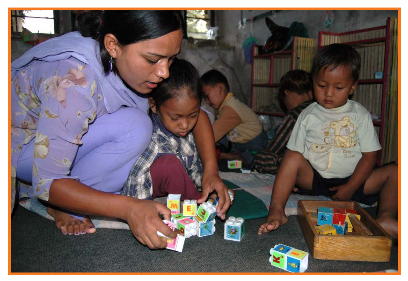
ECD services and preschools support young children's overall development.