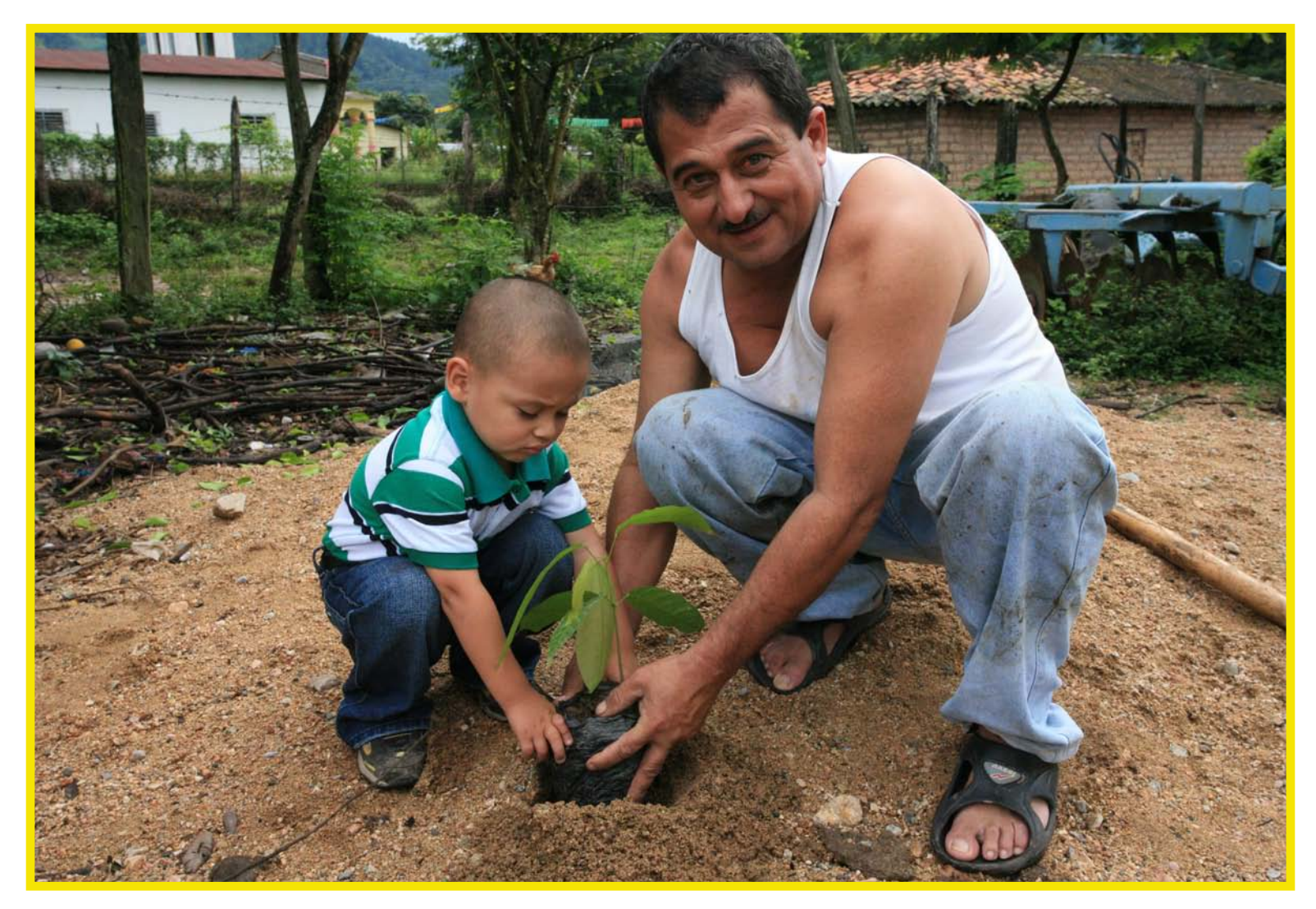
Nurture children's spirituality through safe, loving relationships and positive role models.