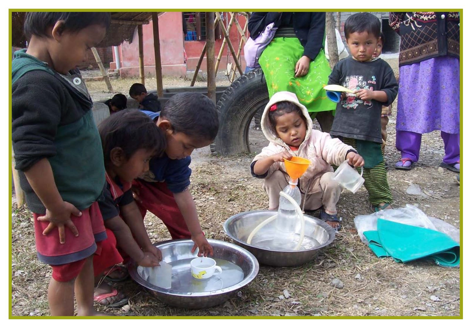
Simply sending children to preschool does not meet their overall needs.