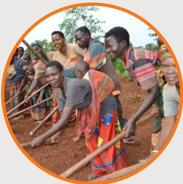
Community members of Gitaramuka commune, Karusi province participating in community works supported by WV cash and voucher project

World Vision Burundi has developed a culture of accountability in every implemented activity. We plan our annual activities with community members.