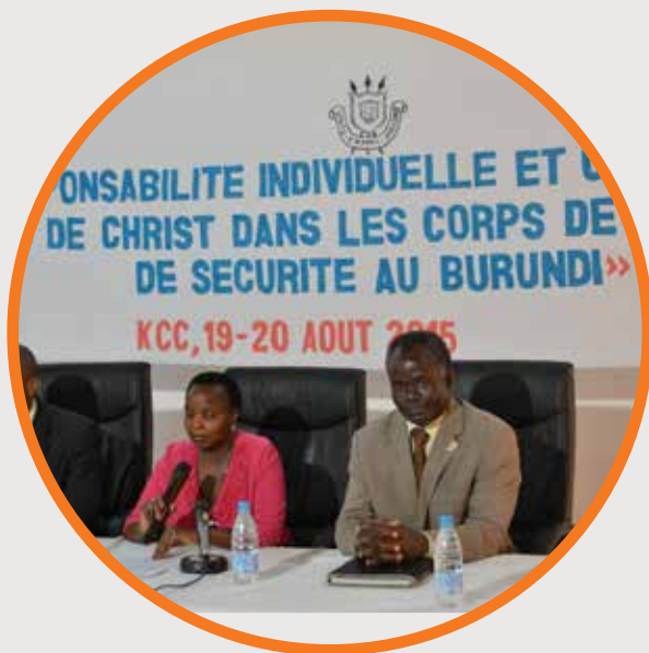
World Vision Burundi acting ND launching peace building workshop for senior civil servants from both the public and private sectors