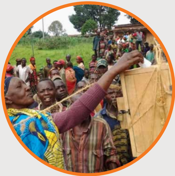
An elderly woman makes use of a WV's suggestion box