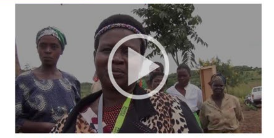
Traditional Leaders urge people to adopt Smart Agriculture