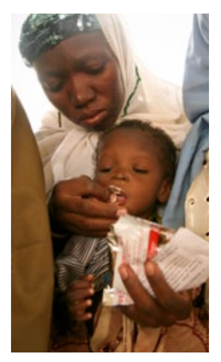
Ready-to-use-therapeutic food (RUTF) is a peanut butter paste fortified with milk and milk extracts, vitamins and minerals. It provides the calories, protein, vitamins and minerals malnourished children need to recover. Children who receive RUTF recover from malnutrition in 6-8 weeks.