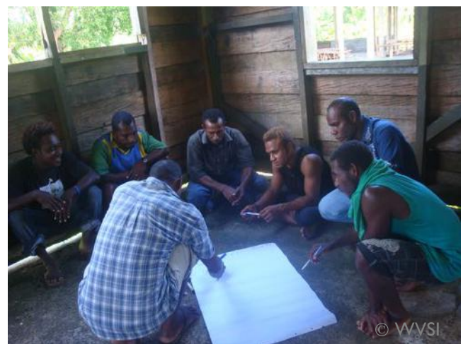
Weather Coast communty members working together to stop gender-based violence.

Two Weather Coast area communities included in the study have had surprisingly positive results – including successfully negotiating with narcotic growers and suppliers to either destroy their own plants or stop the circulation of drugs.