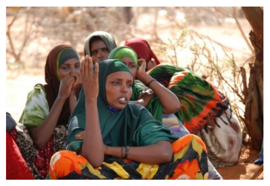
Pastoral women in Beer-Itir village, Dollow district, tell a visiting Sida donor team how SomReP has benefited their community.

Thus, to a large extent, we can conclude that SomReP built its programming on vulnerability and capacity assessments . As a result, the consortium developed a resilience capacities approach leading to cross-sectoral programming and innovation around early warning and action. This required guidance materials for cross-sectoral programming for various livelihoods groups for all consortium members.