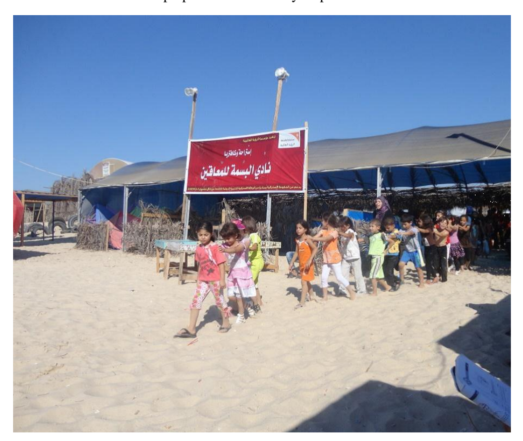
Children in Gaza practise a safety drill.

finances, communications/media, legal issues, security and programme operations. This is reviewed on a quarterly basis, with a strong emphasis on the process of discussing current or emerging risks, rather than the actual output document itself. This has led to increased preparedness and early response measures.