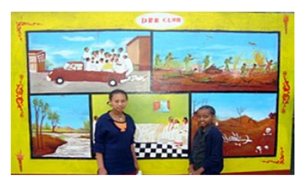
Children in DRR clubs presenting different hazards by drawing on the wall at Metababer school in Addis Ababa.