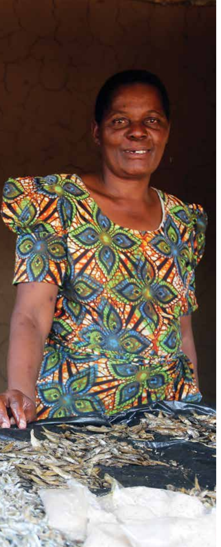
Through agriculture, families have ventured into business