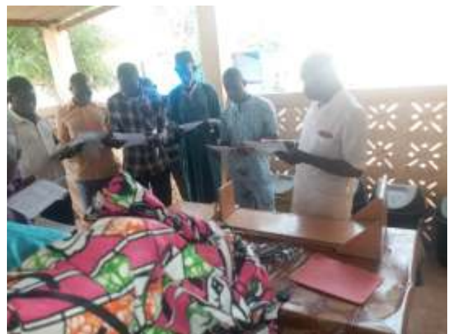
Staff from health services affected areas receiving training on new CMAM protocol.