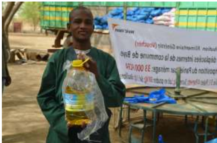
In World Vision Mali Central Mali emergency response, the young in Baye receives food assistance.

HUMANITARIAN SITUATION OVERVIEW : May 2018: A comment made per a candidate for the next presidential elections rises concerns” only the transparency of the presidential election scheduled for July 29, 2018 will prevent a post-election crisis. Mali needs a free, transparent and democratic election to avoid a bloodshed ”. As Ramadan approaches, the threat of attack on state public buildings, hotels, bars and restaurants remains high even during the month of Ramadan in capital Bamako and the central region. Tensions between the two ethnic groups remain high in Koro, Djenne, and Macina districts in Mopti region. The risk of confrontation between the two remains present in Koro and Macina where the “Dozos “locally called traditional hunters from one of the ethnic groups begin to establish check points in some axes. The Dozos have been known to carry out irregular checks of the vehicles.