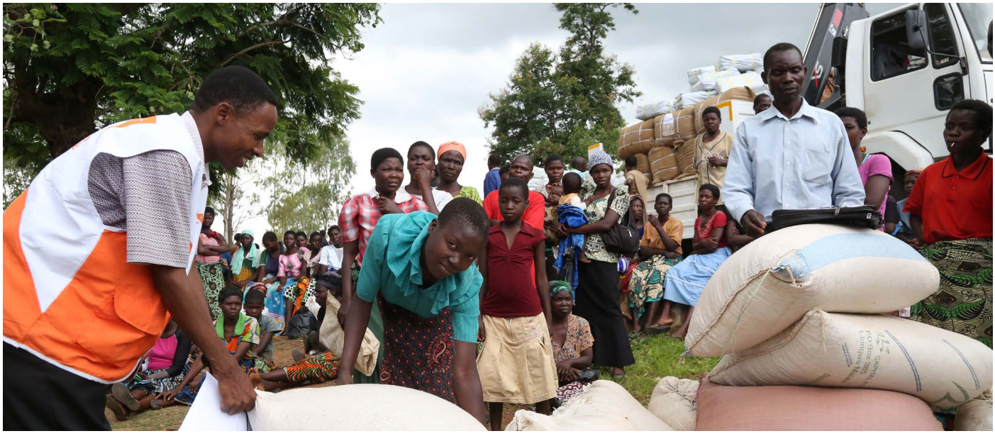
World Vision staff distributing food to draught affected families in Chiradzulu District

Malawi had the biggest response in history during this reporting period where over 6.4 million people were hungry due to El Nino induced dry spells. This led to reduced food availability more especially on poor families. Of the total number of people affected by food insecurity, World Vision Malawi targeted 1.65 million beneficiaries. Below are some of the response highlights.