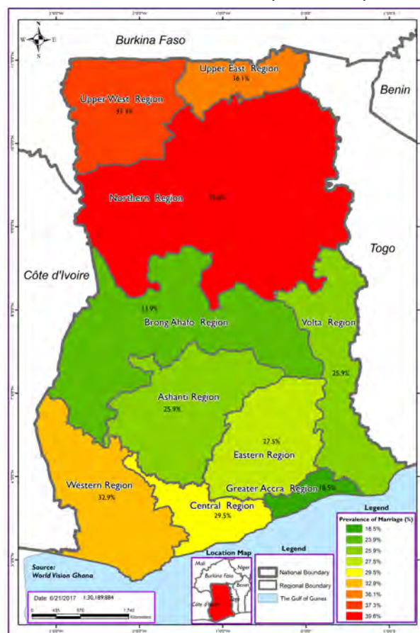
MAP OF GHANA SHOWING PREVALENCE OF CHILD MARRIAGE (GDHS, 2014)

Child marriage rates are also higher in rural areas (36%) compared to urban areas (19%) 3 . Child marriage disproportionately affects girls over boys: among men aged 20-49 years, only 3% were married as boys before the age of 18, compared to 27% of girls 4 . Even though there has been a decrease in the rates of child marriage in Ghana from 31.5% in 2008 to 27.2% in 2014 5 , the current rates are still unacceptably high and need to be reduced immediately to give every girl the right to realise her full potential.